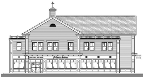
below: design for mixed use building

Tom Kravitz LBV Fall Class, 2002 Burrillville, RI