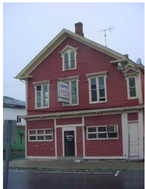
left: current structure

teristics similar to those of existing structures within the main street area. The idea is to reinforce the industrial themes and heritage through architecture in order to improve the economic climate of the Villages and make them competitive with regionalized retail centers. □